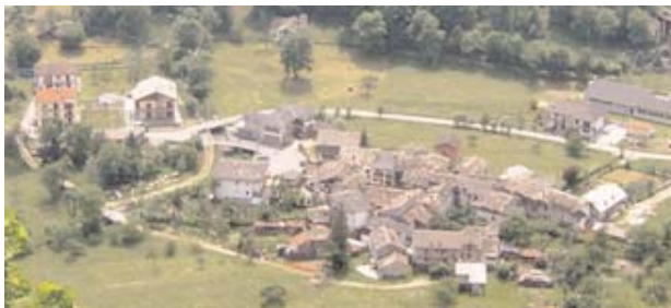
● Village of Pretolungo.

The Tourist Office provides information for renting or buying property in the villages.