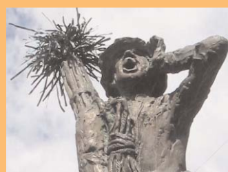
● Monument to the chimney sweeps.