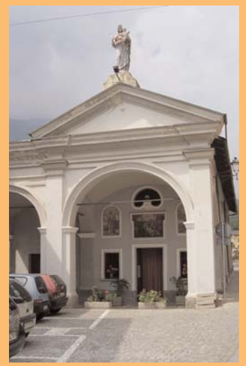
● Cantellino Church.