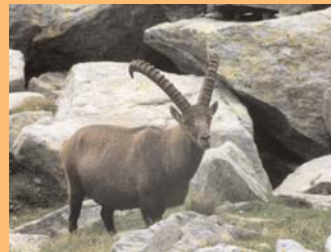
● Mountain goats.