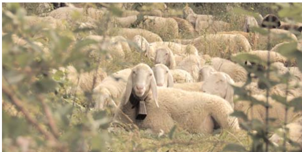
● Flocks grazing.

Locana is located in the heart of the Gran Paradiso National Park, stretching between the Turin province (Orco and Soana Valleys) and Val d'Aosta (Cogne, Savarenche, and Rhêmes valleys) covering an area of about 70.000 hectares. This was the very first National Park established in Italy, and is dominated by the grandeur of the enormous Gran Paradiso mountain range, that exceeds 4,000 metres at its highest point.