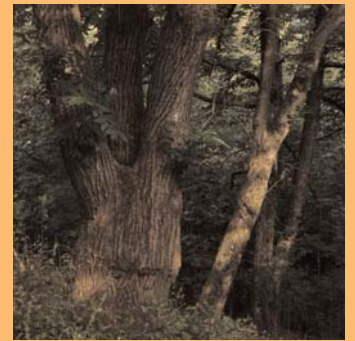
● Chestnut tree.