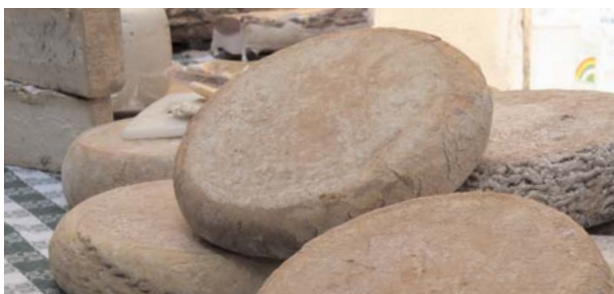
● Toma cheeses.

Local festivities, celebrations, events and exhibitions are held all year round in Locana and its valleys. Some celebrate the local traditional trades and products, from the famous chimney sweeps to chestnuts; others are linked with local patron saints and pilgrimages to very old churches in the mountains. Others are for sports and cultural events.