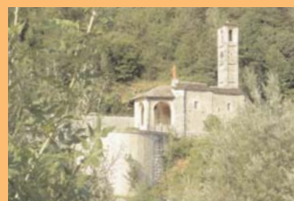
● Church at Gurgo.